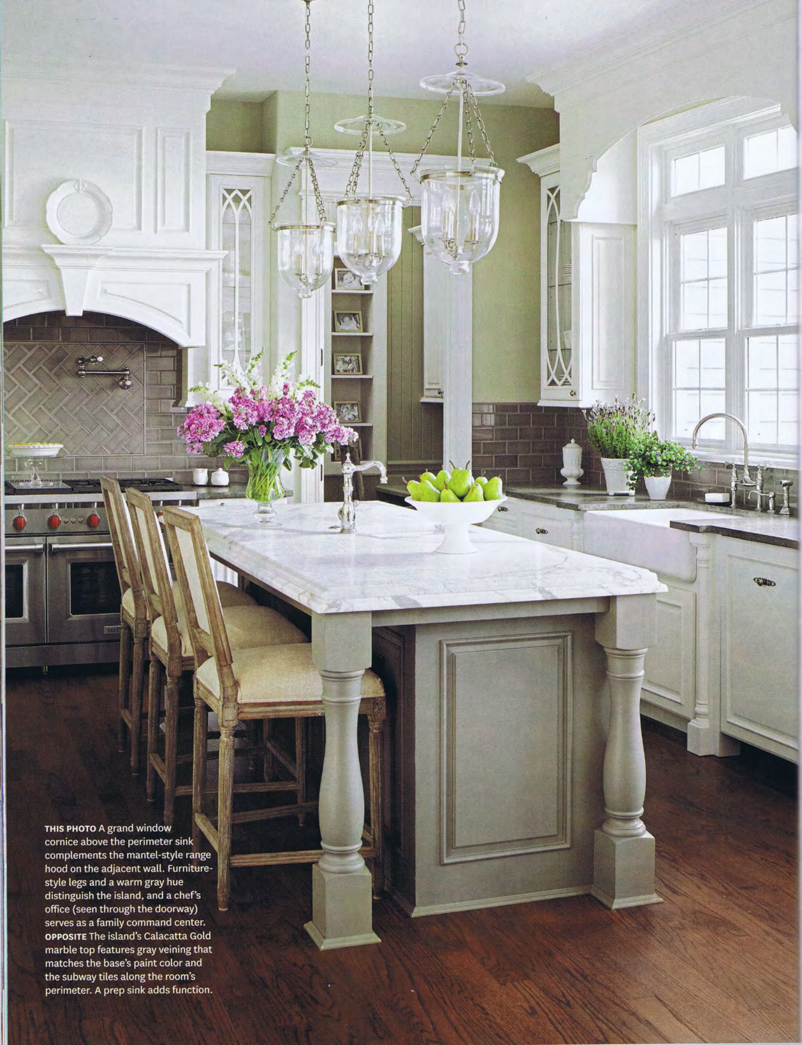
THIS PHOTO A grand window cornice above the perimeter sink complements the mantel-style range hood on the adjacent wall. Furniture-style legs and a warm gray hue distinguish the island, and a chef's office (seen through the doorway) serves as a family command center. OPPOSITE The island's Calacatta Gold marble top features gray veining that matches the base's paint color and the subway tiles along the room's perimeter. A prep sink adds function.